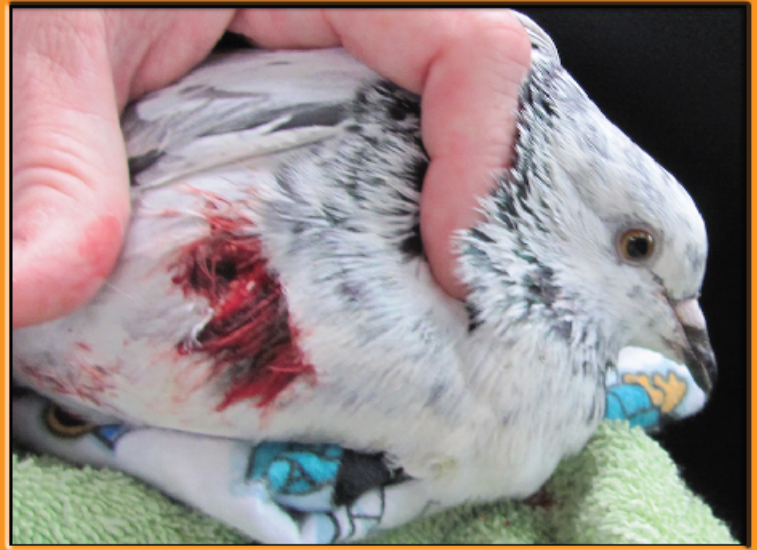
One of the many victims of the Philadelphia Gun Club that we rescued. Pigeon shoots are killing for the sake of killing with pleasure taken from the spilling of innocent blood

The federal lawsuit targeted not only SHARK but five of our investigators by name. We contended that the lawsuit was baseless and the federal judge hearing the case agreed! The judge threw out the lawsuit before it went to trial, stating that the charges that we violated federal law were "sheer conjecture" and unsupported by any evidence. This was a legal victory where David stood against Goliath and won.