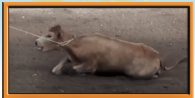
This innocent calf was choked by a rope and injured at the Cheyenne Frontier Days Rodeo

The Cheyenne Frontier Days Rodeo (CFD) is the world's most cruel rodeo, and SHARK was there again this year to document the suffering and deaths that happened for entertainment. When the Wyoming Tribune Eagle did a fluff piece on the CFD, we released a video unmasking their biased reporting. To my surprise, I received a call from the editor of that paper who did not defend what had happened but instead acknowledged that they had indeed made a mistake by publishing such a one-sided story. This was an important turn of events and proves how our work documenting animal cruelty can change minds.