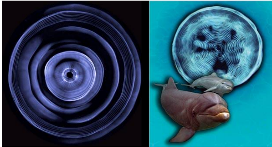
Figure 2c One such indications of that possibility is their ability to send and receive 3-Dimensional pictures of what they have seen or are seeing to each other....just by 'thinking'