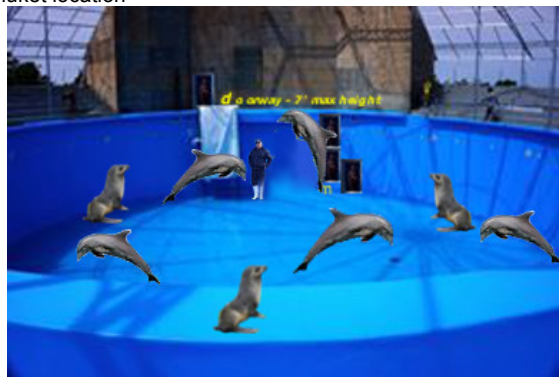
Figure 1c Phuket's tank with its intended occupants (minus the human of course) 5 Bottlenose dolphins + 2 Fur Seals