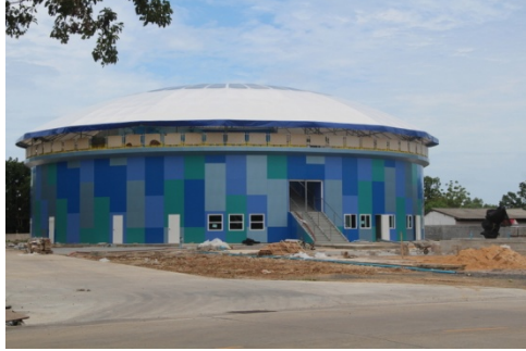
The Nemo Dolphinarium –Phuket