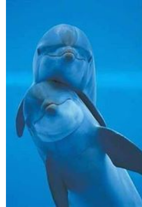
Figure 2c Could those two dolphins be with a degree of intelligence to which man has yet to evolve?

Before you dismiss that last statement as impossible or unlikely, please consider the following known facts regarding the cetaceans in general and dolphins in particular, with respect to their abilities in the natural habitat, the OCEAN, to which they are uniquely and genetically so adapted.