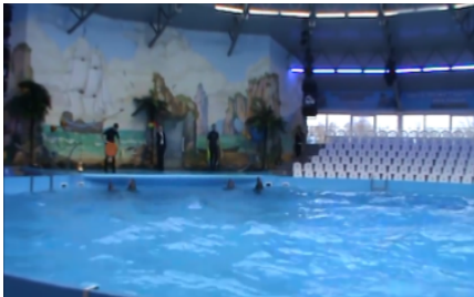
Figure 1a Filled tank identical to tank at the Phuket location

** Because those tanks are nothing more than prisons! Prisons for dolphins! Prisons that, if a comparable structure were to be made for humans, they would be condemned outright as a structure which, as housing for even our most heinous criminal, would be considered to be a violation of their "human rights" because this would subject the occupant to cruel and unusual punishment!!**