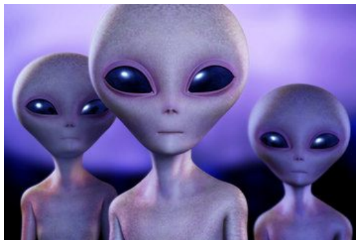
Figure 2a Man's popular concept of "Non-Human Intelligence" The Extraterrestrial Human-Like Creature