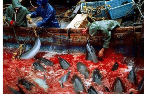
The Taiji Cove of Hell!!!

For further information, you are welcome to visit my video at https://youtu.be/5hRz4hwxzfo