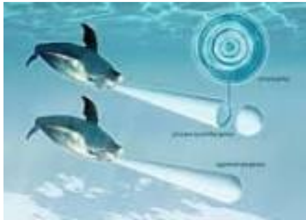
Figure 2d One dolphin sees the object and then sends a 3-dimensional image of what is seen to another dolphin (or dolphins)

Supportive reading for this conception of the cetacean can be found in the following articles: