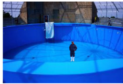
Figure 1b Empty Phuket pool with 5'7" man (to scale) standing in it