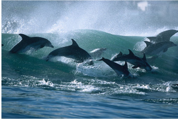
Figure 2b Could the "Non-Human Intelligence looking at us We seek be right here on earth, in our oceans? and understanding