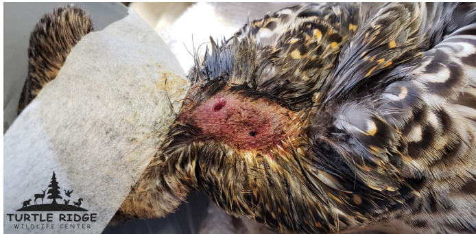
Cat bites on the neck of a Green Winged Teal

We need to note that even though these good-hearted volunteers do all they can for the “outside cats,” the cats will still “just be cats.” That is, even if they’re fortunate enough to be well-fed, they are still likely to prey on birds and other small mammals — our wildlife — because that’s just what cats instinctively do !