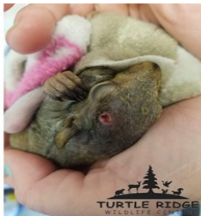
Puncture wounds from a cat bite on juvenile tree squirrel

I make that point because the current resources available to fully set up and administer volunteer-based TNR programs are woefully inadequate. There is not nearly enough trapping, and therefore not nearly enough spaying and neutering. As a result, we have an ever-increasing number of feral cats preying on wildlife, causing untold numbers of injuries, “orphan” situations, and death to the victims of their predation.