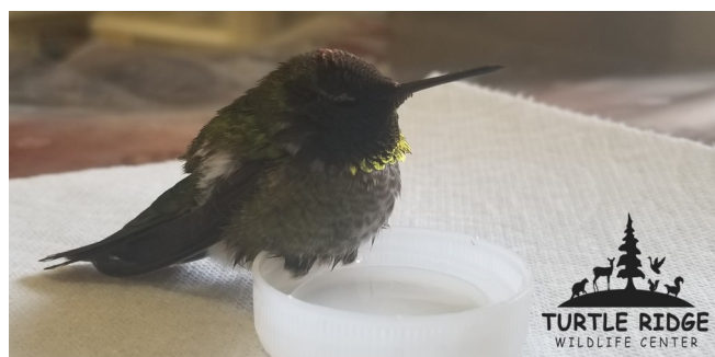
Cat Caught Anna’s Hummingbird

It’s also crystal clear that the numbers of our wildlife species have been diminished by cats — and are being further diminished non-stop. One can find reports that the number of birds and small mammals lost, due to “cat trauma,” is in the billions .