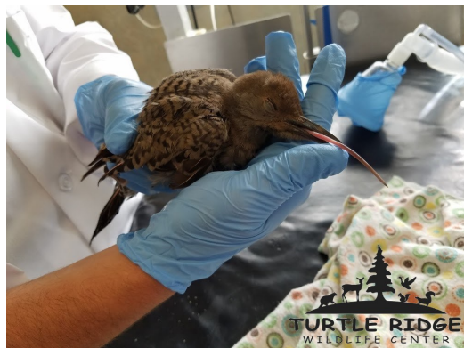
Cat caught northern flicker

Ideally, we could “clone” an organization like FCCO, and add their services to cities, counties, and states across the entire United States — since the cat-related problems exist wherever unaltered cats are free-roaming. The huge impact feral cats have on wildlife is easy to understand, but what else can and should we do about it?