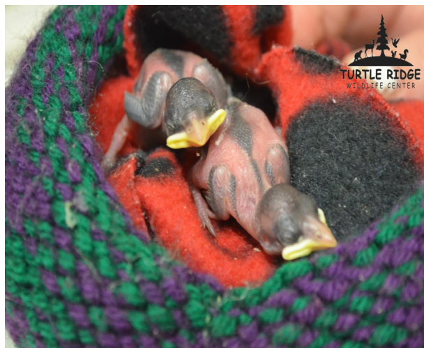
Hatchling Tree Swallows— orphaned after their mother was killed by a cat

In the meantime, which organizations have “the injured and orphaned wildlife fallout” from cat-caused trauma thrust upon them — without taxpayer-provided compensation? For sake of discussion, I’ll call these organizations “Wildlife Centers.” They are few and far between across the entire country. We’re fortunate to have a local example in Salem-based “Turtle Ridge Wildlife Center”/TRWC, one of only two such full species wildlife rehabilitation centers in the state’s entire western region. TRWC’s mission is to provide care to injured or orphaned Oregon wildlife — with the goal to release the victims back to their natural habitat.