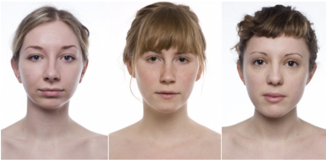
Fig. 2: Selection of Women to gargle the milk (Hill)

As Hill explains the reason he created the website, which makes the connection to both race and gender explicit: