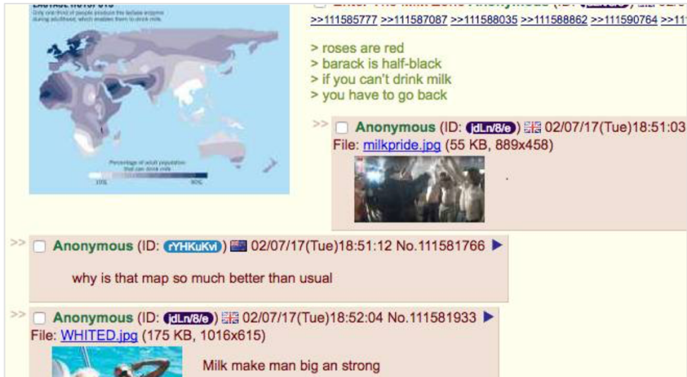
Fig. 2: 4chan discussion board. (Reproduced in Swerdlhoff)

Here (fig. 2) is a screen shot from a conversation on '4chan,' an online discussion board dominated by the 'alt-right:' (Please note: the following screen shot includes racist hate speech.)