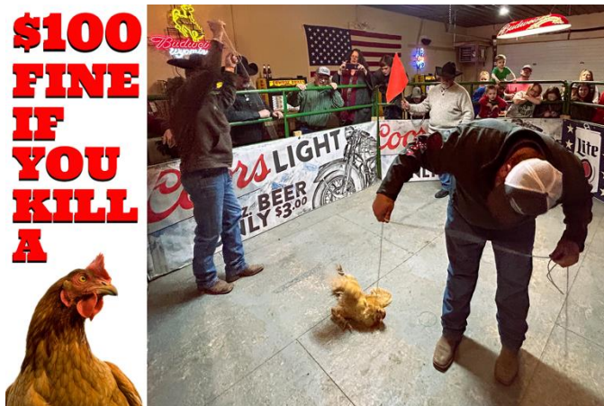
A header pulls up the rooster's head while the heeler ropes the rooster back by their feet. The birds face the chance of death while the worst the humans face is a $100 fine.

Humans of all ages can watch or participate in the chicken roping craziness. To enter one must pay a $5 entrance fee, but participants can stack up their entrance fees and their chances of winning first, second, or third place by trying numerous rounds and numerous partners. Killing a chicken is one of the risks all participants take, which would be a $100 fine if it were to happen.