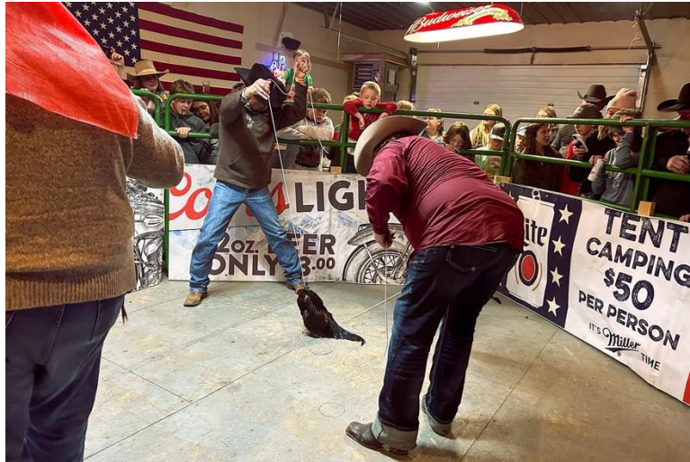
Two men actively torturing a rooster in front of a crowd full of children and adults. The man in the maroon top was a repeated offender and heavily intoxicated, not exactly a great role model for the kids.

It was very common for the chickens to try to escape their tormentors, which caused a lot of screaming amongst the crowd, as if the birds were flying outside of the little arena to terrorize those who had sadistically been smiling and laughing at the frightening and threatening ordeal that was repeatedly being imposed onto them. Some chickens were roped while flying away and sent right back onto the ground, which was marked by a loud bang as they hit floor. Sometimes the roosters got eerily quiet, a choice not of their own as they were being choked by their abusers. One man from Texas who was by me and watching this event for the first time in his life remarked “This is the coolest shit.” He was observant enough to notice a rooster “playing” submission and laying on top of his feet, so he couldn’t get roped and pulled back yet again. Straight from the mouth of the Texan visitor : “That shit’s playing submission. It’s covering its feet like it knows.”