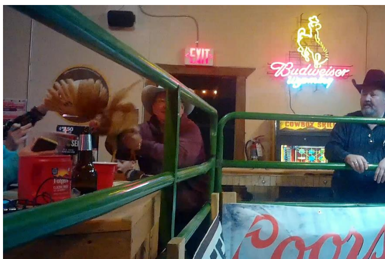
A chicken who tried to escape gets grabbed by their legs at the announcer table. Despite showing the clearest signs possible with movement and vocalizations of not wanting any part in this event the birds will still be used again repeatedly.

Although the parents want their kids to be as amused as they are at the violence taking place in front of them, I don't think all of the kids shared their parents enthusiasm. One child can be heard in my chicken roping expose yelling out "You're probably killing that poor bird." Aside from trying not to kill the birds, participants must follow other basic rules: the bird must first be noosed by the neck in one or two attempts from the header, the bird must then be noosed around their legs in an attempt or two by the heeler (you only get two attempts if the header was successful on their first attempt). It wasn't uncommon to witness the ropers getting their cords caught around the wings of the birds, causing panic among the far more rational beings.