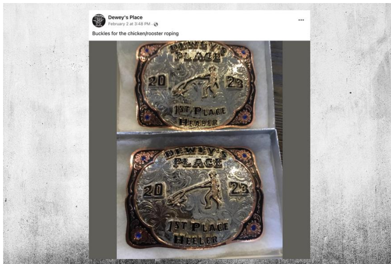
The 2023 Dewey's Place chicken roping belt buckles for the winning header and heeler. Could it be any more clear that humans find these belt buckles more valuable than the actual lived experiences of the chickens?

I want a goddamn buckle for winning chicken roping so goddamn bad. I will travel 4 hours down here just to win a chicken roping buckle.