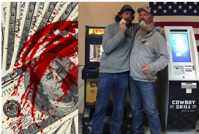
Featured on the Dewey's Place Facebook page, one of the repeat intoxicated chicken roping offenders shows off the money in both of his hands that he won from animal abuse at this year's event. The arcade game right behind him is one of limitless examples of how we can play games and have fun without involving non-consenting individuals who've done nothing to deserve being tormented and traumatized.

No human would consent to being on the opposite end of the rope, the end where your neck, head, legs, and feet are pulled back violently by someone trying to dominate you. If something is so aversive to us how can we pretend that others don't mind or that others don't experience an extremely aversive event as we would? The only way a human would ever have involvement of being roped in a rodeo style event is if they were drugged and unable to fight back or escape. Other animals are far more similar to us than they are different and they all show extreme resistance when it comes to anything that involves a rope going around their body. If we want bodily autonomy for ourselves, don't we only deserve it if we are willing to afford it to others?