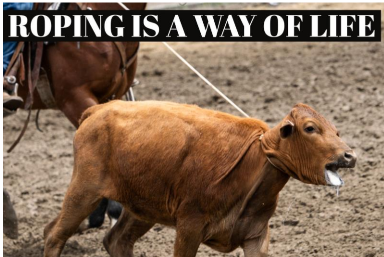
A calf being choked and pulled back at a US rodeo event I attended in 2018. No matter the year of history and no matter the species, we are all equally against being subjected to mistreatment like this.

No human would consent to being on the opposite end of the rope, the end where your neck, head, legs, and feet are pulled back violently by someone trying to dominate you. If something is so aversive to us how can we pretend that others don't mind or that others don't experience an extremely aversive event as we would? The only way a human would ever have involvement of being roped in a rodeo style event is if they were drugged and unable to fight back or escape. Other animals are far more similar to us than they are different and they all show extreme resistance when it comes to anything that involves a rope going around their body. If we want bodily autonomy for ourselves, don't we only deserve it if we are willing to afford it to others?