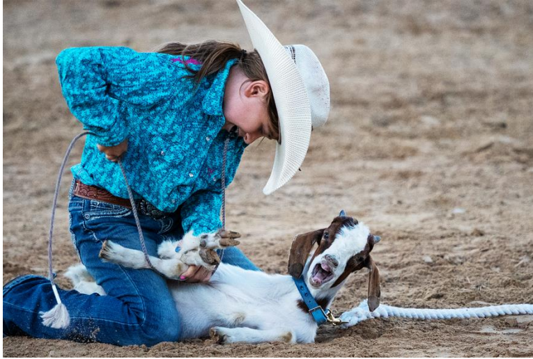
A baby goat being tied up by a child for a round of goat tying at a Texas rodeo. Goats are typically used at least a couple times in a row before they are changed out for a new goat.

The participant who stood by me for a bit and referred to one particular rooster as “nice” lit up when she found out that she could potentially win a chicken roping belt buckle if she were to get first place. Upon learning about the belt buckle she said: