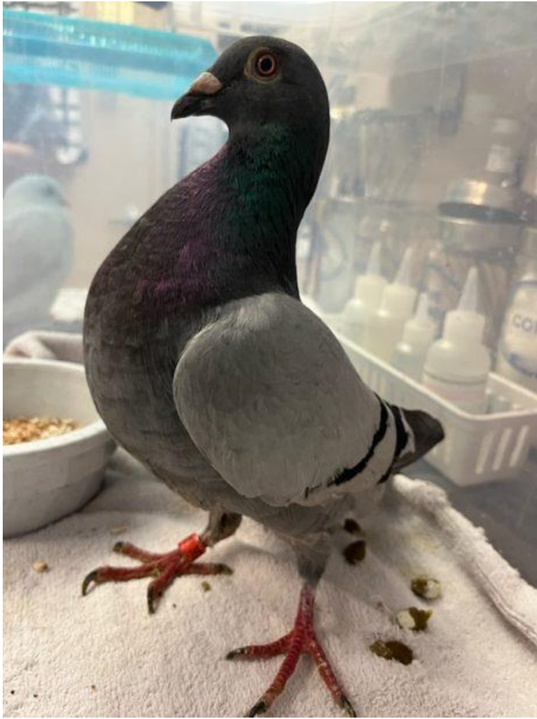
3/15 Lilo's ready for discharge