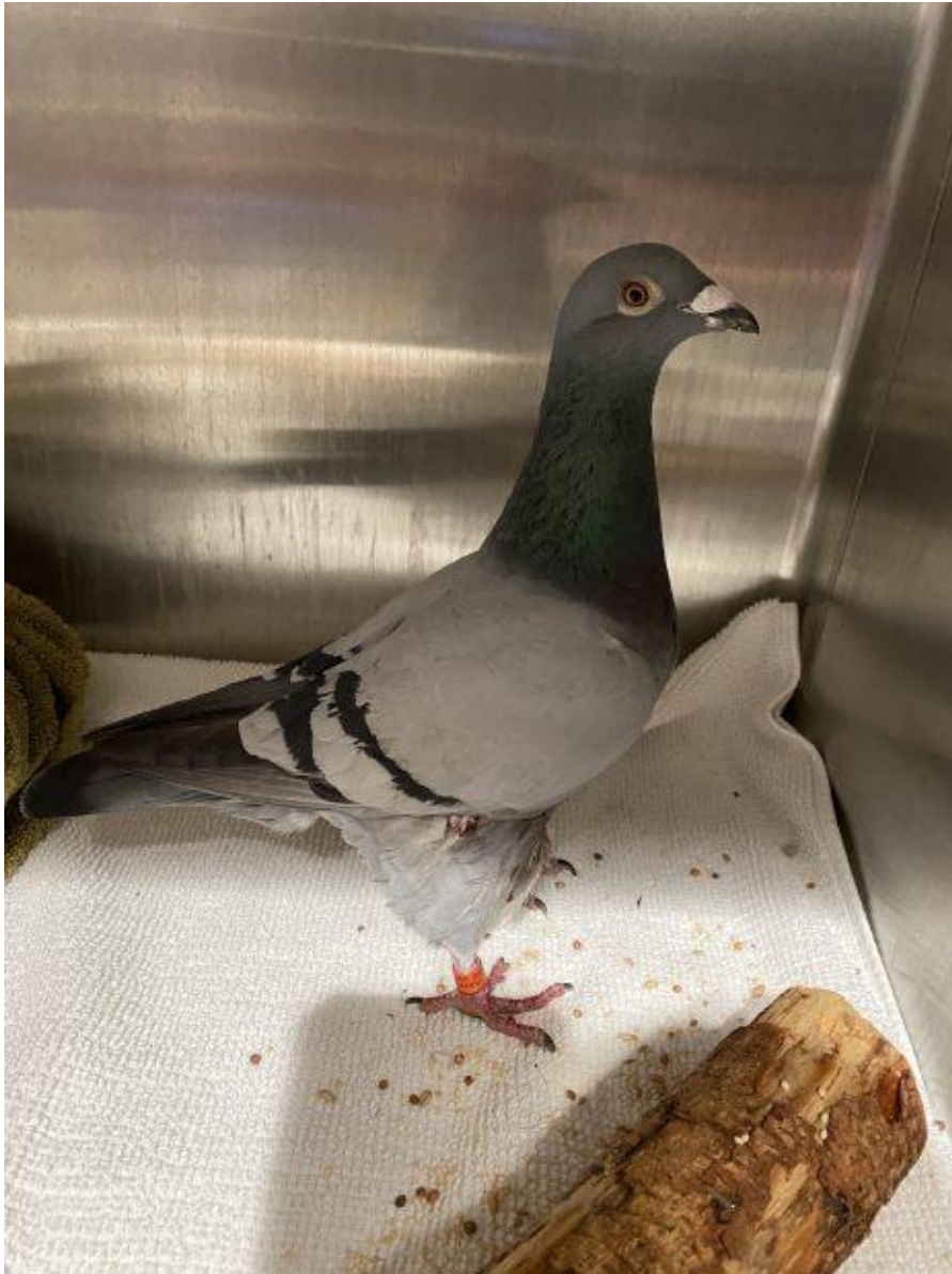
At the shelter, injured & needing avian vet care

The shock and pain and terror overwhelmed him. Sharp talons ripped into his leg and side and he struggled and flesh tore and miraculously, Lilo got away. Badly injured, he fell to the ground, still doomed except for another miracle: a nice person scooped him up and took him to the local open door shelter. The shelter took him in but, without avian vet care, he was still doomed.