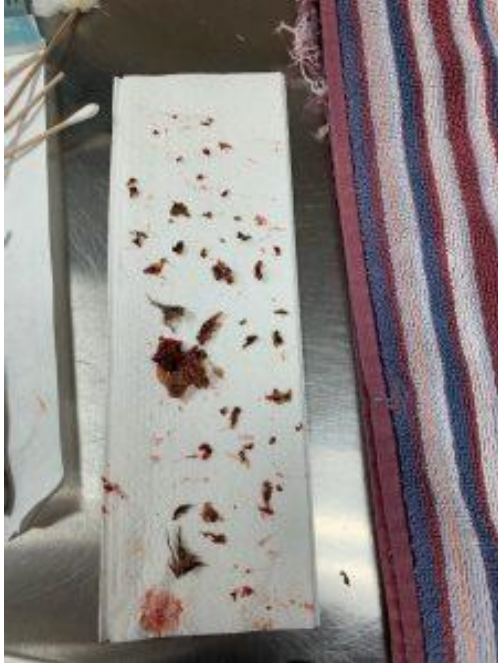
3/11 Dead tissue removed during second sedated debridement