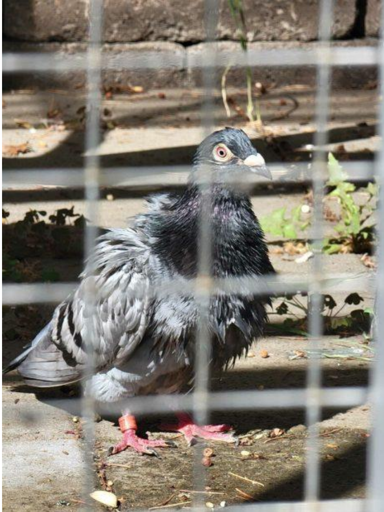
3/26 Recreation time, first bath& loving the sunshine