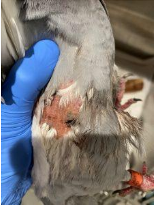
First glimpse of the wound

Shelter staff reached out to us for help on March 4th and Lilo was picked up by a volunteer and emergency transported 50 miles to Medical Center for Birds where, despite being booked solid, they said yes to helping him.