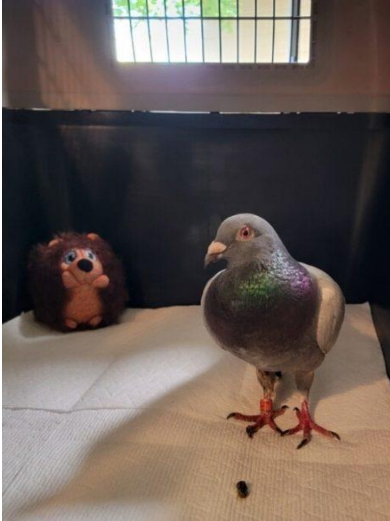
Lilo's first day at his foster home