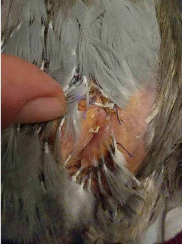
3/22 Healing up beautifully