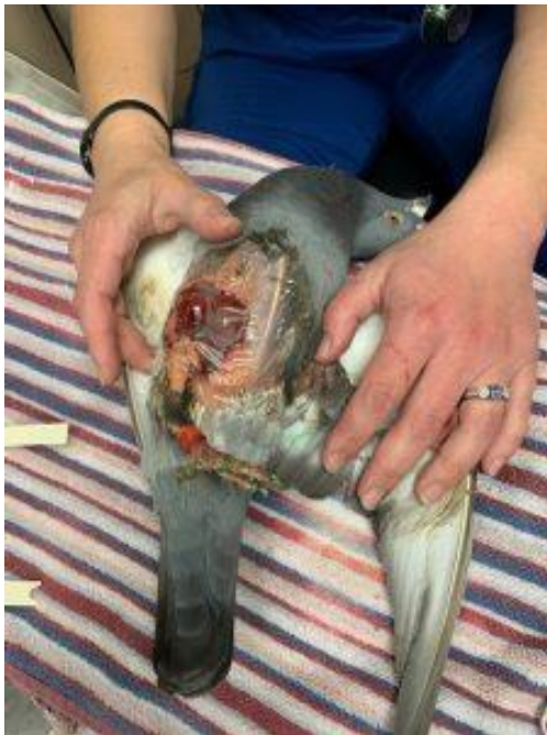
3/11 Cleaned wound protected by Duoderm