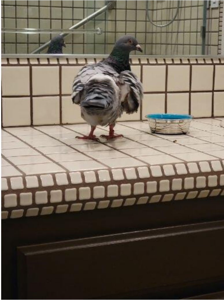
3/21 Having some cage free time in the bathroom