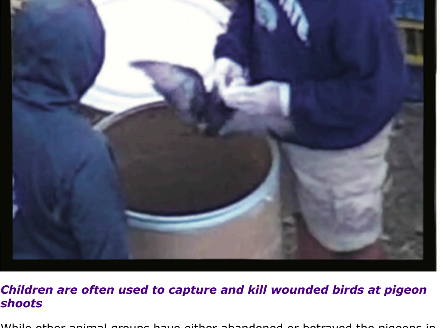
Children are often used to capture and kill wounded birds at pigeon shoots

Live pigeon shoots in Pennsylvania, where innocent birds are forced into small boxes, then launched into the air and shot for fun, have been decimated by our relentless efforts against them. Most of the birds, who are on the brink of starvation (which makes them easier to shoot) do not die right away, but instead, suffer for hours or days after being wounded. These shoots are truly depraved and cause incalculable suffering.