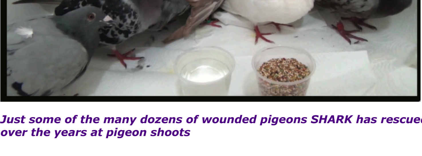
Just some of the many dozens of wounded pigeons SHARK has rescued over the years at pigeon shoots

The main pigeon shoot SHARK focused on in 2021 was the notorious Philadelphia Gun Club. A SHARK investigator filmed a number of shoots at the gun club, capturing horrific acts of animal cruelty and a complete disdain for human life, as the wealthy and politically connected members of the gun club openly flouted COVID restrictions that were in place. These sociopaths just didn't care about anything other than slaughtering small birds for fun.