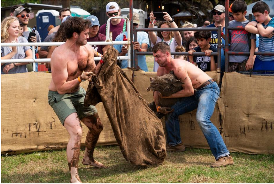
A helpless pig is manhandled by an extremely aggressive man as he or she screams in protest, pain, and terror.