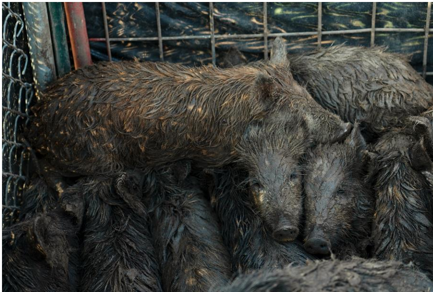
Pigs huddled together in fear at the Frio River Fest wild hog sacking. They want nothing to do with these humans or their “games.”

I campaigned against this event back in early 2019 and in not much time at all Jimmy Joe’s announced via social media that they were cancelling the wild hog sacking event. After they announced the