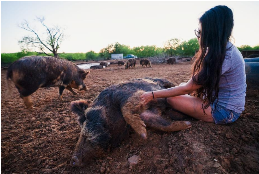
A friend and I coexisting with feral pigs at a sanctuary. We were met with curiosity and friendship by those who approached us and we gave the same back.

Below I will share contacts and a Google Docs page that gives a rundown of the event and has streaming and download links for photos and videos. I will have a functioning website soon that will contain a page for this event. Please share this article, video footage, the petition, and please consider contacting Jimmy Joe's and Neal's Lodges at the very least. Humans should not be able to get away with this insanity in peace and comfort, especially in 2023.