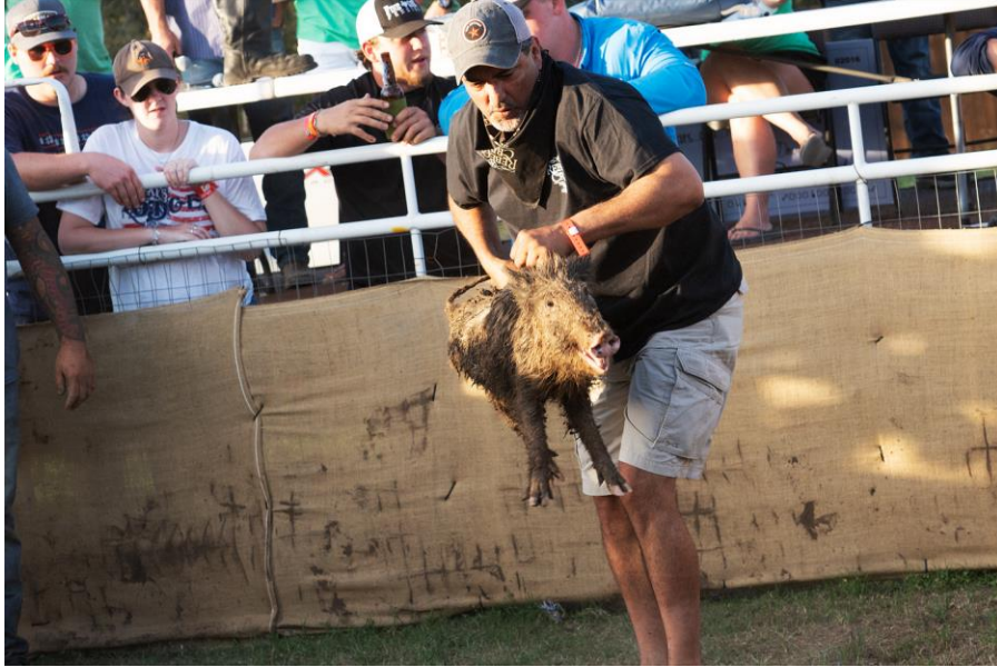
A pig for the wild hog sacking event is held up by one ear and the skin on their back. The pain and suffering is truly unimaginable.