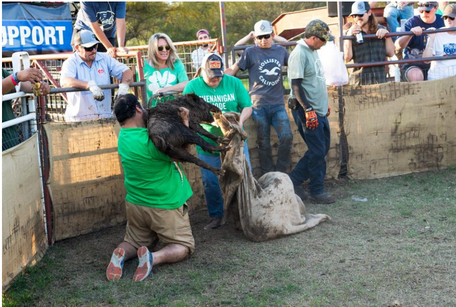
A couple spends their anniversary together brutalizing young defenseless animals. You can watch how they spent part of their anniversary here .