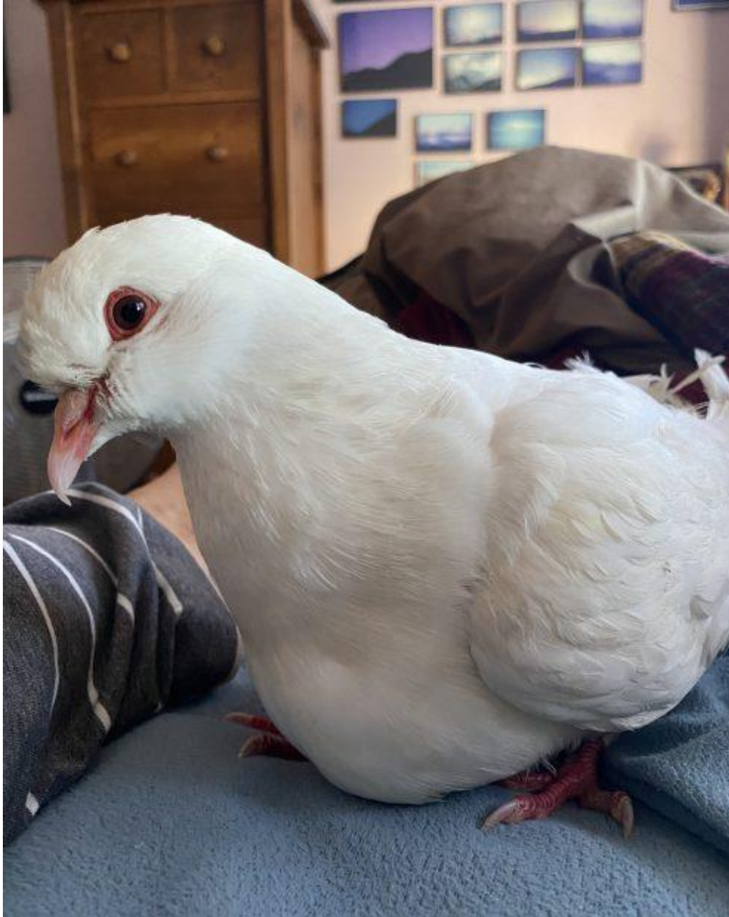
Willy's crop is always big & saggy

His GI system is slow but effective, he's been eating & maintaining his weight. He's been treated for parasites, coccidia & yeast. His blood tests have been normal, no metal toxicity. His fluorscopy didn't provide any clues.