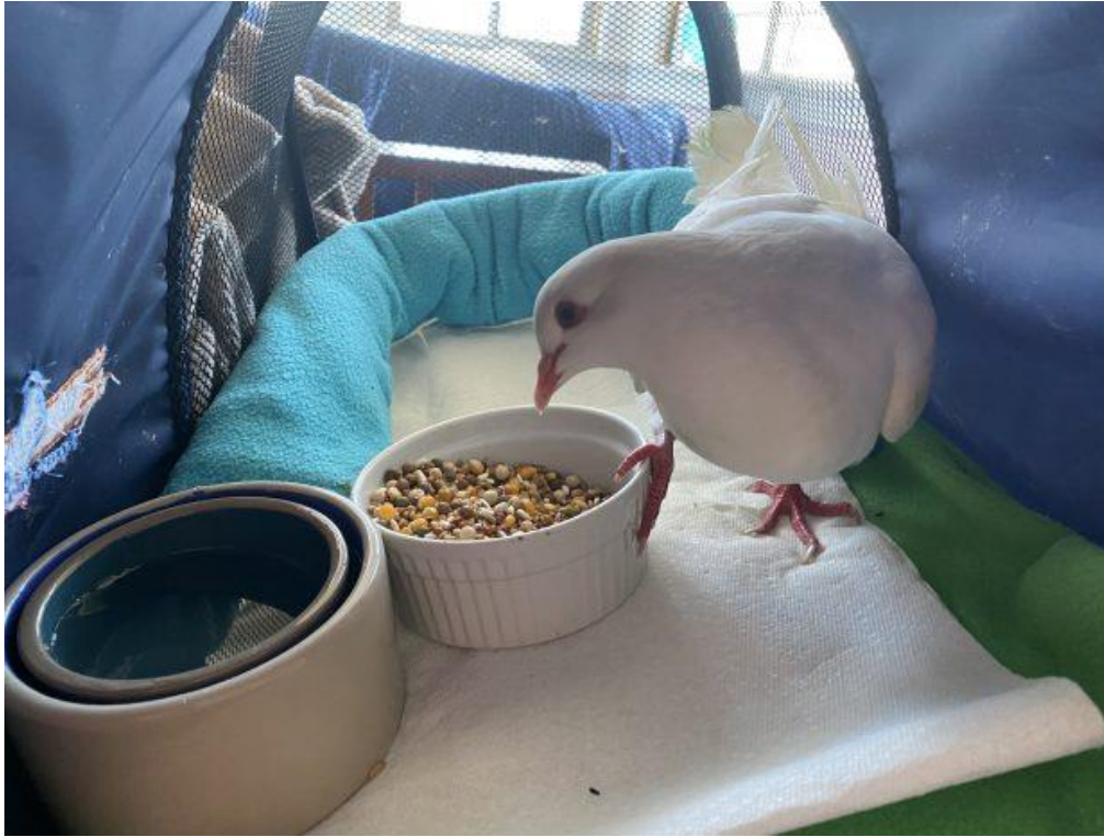
Willy, who hadn't self-fed for two weeks, immediately started eating!

When a pigeon presents with torticollis, we always suspect paramyxovirus (PMV) & we did with Willy but his illness has been very peculiar. The torticollis is resolved but he's still a little neuro. His crop is inexplicably & persistently big & saggy.