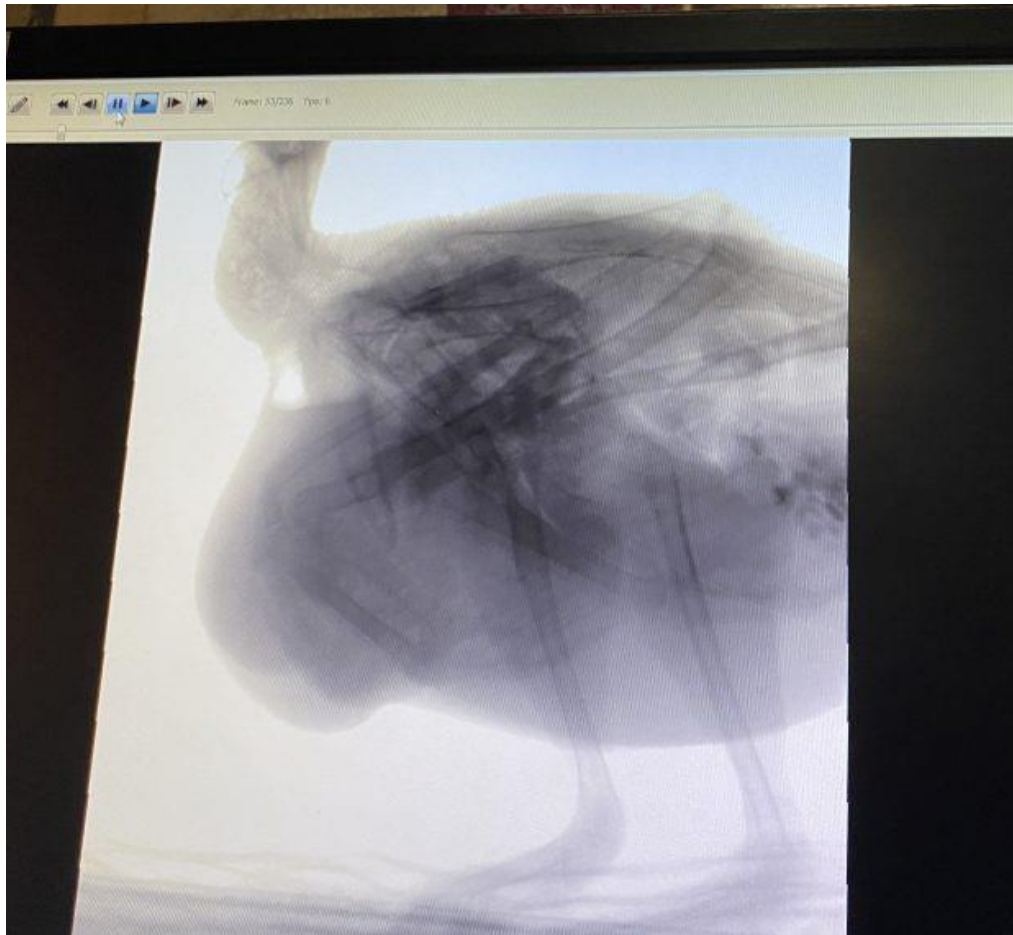
Willy's fluoroscopy shows the big crop but not why

He is still wonky. He naps a lot, is still a little wobbly, sometimes circling. He's recently started fly-launching down but he can't yet fly up successfully. He likes taking wonky baths, hanging out with gentle birds & sitting in the sun spot which he follows all day. He's finished a long course of antibiotics (Trimethoprim Sulfamethoxazole) & is halfway through four weeks of Robenacoxib injections (anti-inflammatory). He's still fostering with me & he likes to be close.