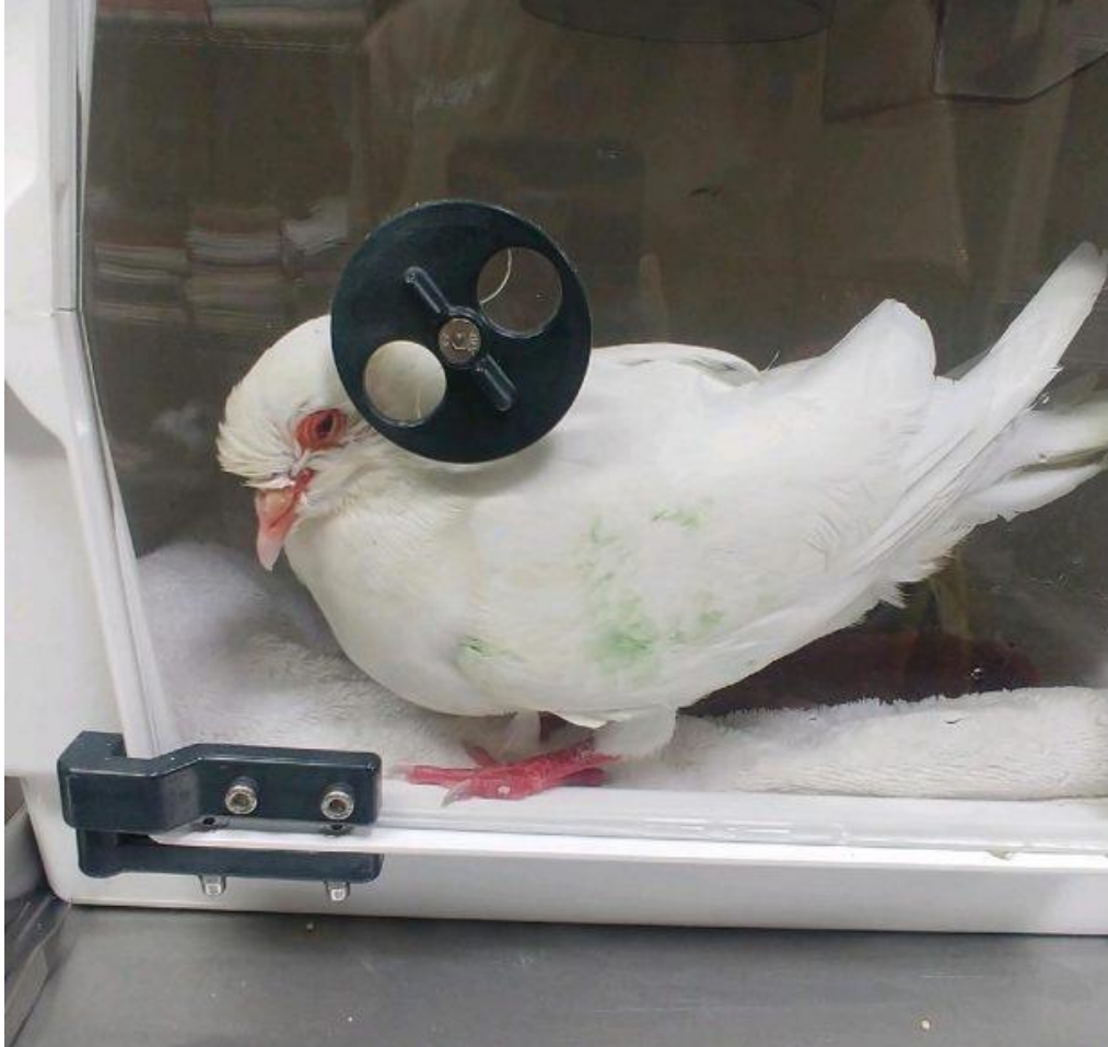
Despite shelter vet care, Willy was getting worse