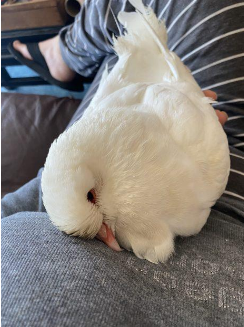
Snuggling napping Willy

He doesn't like hands or being picked up but he likes laps & appreciates having a BFF. His forehead feathers are often floofed in contentment & sometimes he coos at us. He LOVES peanuts. He is making very gradual progress. Only time will tell us how far he'll go.