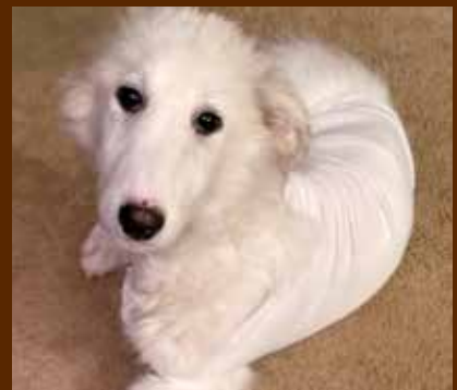
Photo: Maggie after surgery, National Great Pyrenees Rescue

Thankfully, Maggie has thrived under the love and care of her new family and, now renamed "Bunny," she gets around just fine on her three legs. She is one of the lucky ones.