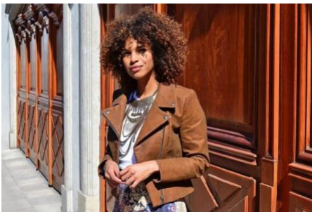
A cork alternative leather jacket by Ovide

These are just some of the reasons animal materials are harmful to the environment. It is clear that to be a true environmentalist, we must not purchase clothing, shoes or accessories made from animals. There are plenty of animal-free bags, shoes, jumpers, jackets and other clothes which you can wear without harming animals, or the planet. Please choose them, and choose kindness!