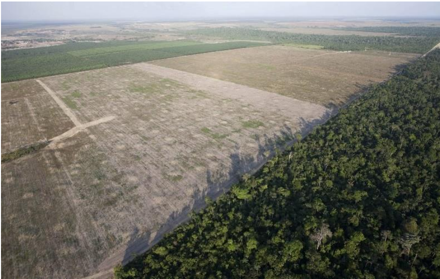
Aerial view of forested land around Paragominas, Northern State of Para, Brazil.

Outside of Australia the situation is just as bad. Animal agriculture is responsible for around 90% of destruction in the Amazon rainforest , one of the worlds greatest carbon sinks. Much of this destruction is for cattle farming, for both beef and leather, Brazil being the second largest exporter of raw cow hides . Intense land clearing is not only harmful to the planet itself, it also negatively impacts the indigenous people and animals that live off that land.