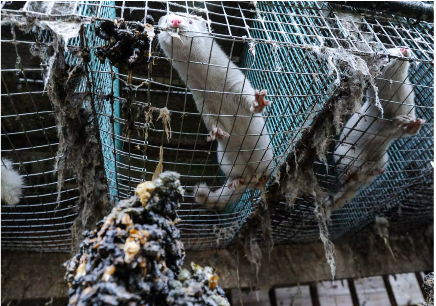
Piles of feces under mink cages at a fur farm. Sweden, 2010.

With little meaningful regulation dictating standards of care or attempts made to monitor conditions, fur farms demonstrate extremely poor animal welfare practices with no acknowledgement of these wild animals' species-specific needs as non-domesticated, solitary, and carnivorous animals. For example, minks are often kept in completely barren caging with no solid flooring, just 1' X 1' X 3' in size, and sometimes stacked on top of one another. While this setup allows farmers to maximize the number of minks they can have in a limited amount of space, minks may be consequently showered with urine and feces from those living above, exposed to each other's respiratory excretions, and have little access to sunlight or air circulation, which result in incredibly unsanitary housing conditions that exacerbate the rate of disease spread. Additionally, despite being semi-aquatic animals and spending much of their lives in water in the wild, water beyond the minimum needed for drinking is almost never provided (Born Free USA, 2020).