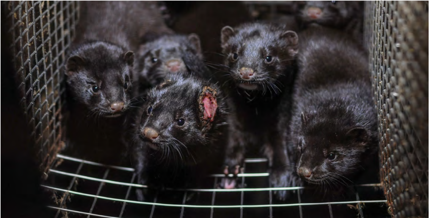
Minks frequently wound and cannibalize one another in the cramped conditions of fur farms. Sweden, 2010.

While all environments that allow unnaturally close interactions between wild animals and humans are dangerous, minks at fur farms present an elevated threat to human public health and safety. Minks demonstrate a physiologically similar upper respiratory tract to humans, meaning that they can become infected by and transmit some of the same respiratory viruses. Additionally, the ability of mink to acquire and spread both human and animal respiratory viruses renders them potentially potent “mixing vessels” for generating novel pandemic viruses by reassorting currently circulating influenza viruses. Animal experiments have confirmed that minks can transmit avian and human influenza viruses, and that human influenza viruses (but not avian viruses) were even capable of aerosol transmission (dispersed through the air and highly contagious) among minks (Sun et al., 2021).