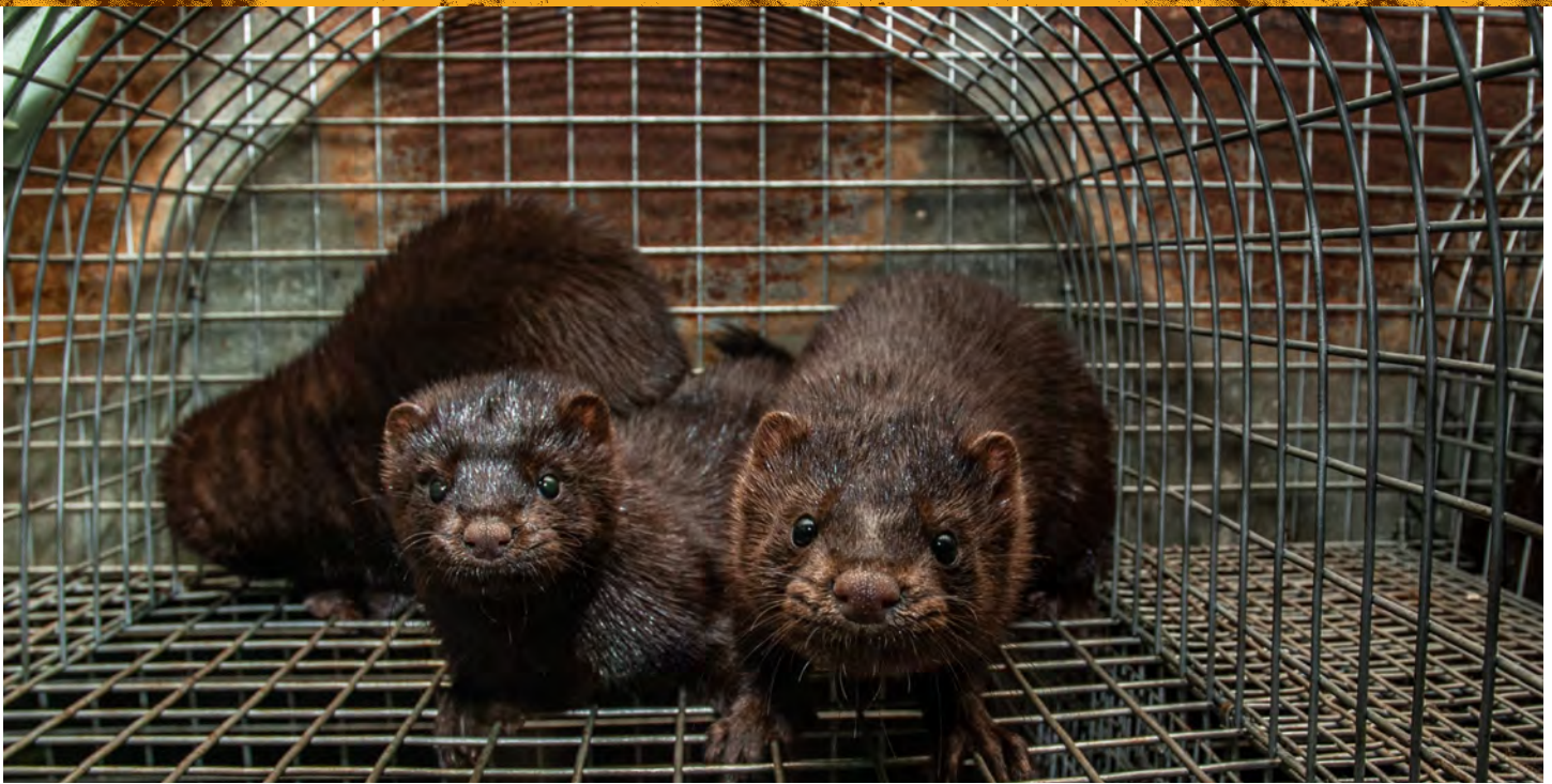
Three young minks, approximately 4 months of age, inside a cage at a factory farm in Italy. They will be killed in a gas chamber when they are about 7 months old. Italy, 2011.

these efforts quelled the virus spread. With mounting public safety concerns following the continued rapid spread of COVID-19 via mink farms, several European countries made plans to ban fur farming altogether, including Italy, France, Belgium, the Netherlands, Norway, Slovakia, Bosnia and Herzegovina, and Estonia. Alarming, even after these efforts to minimize COVID-19, variants of COVID-19 that mutated separately within mink farms appeared in Europe and the U.S. in people who had no direct connection to mink farming (Shah, 2022).