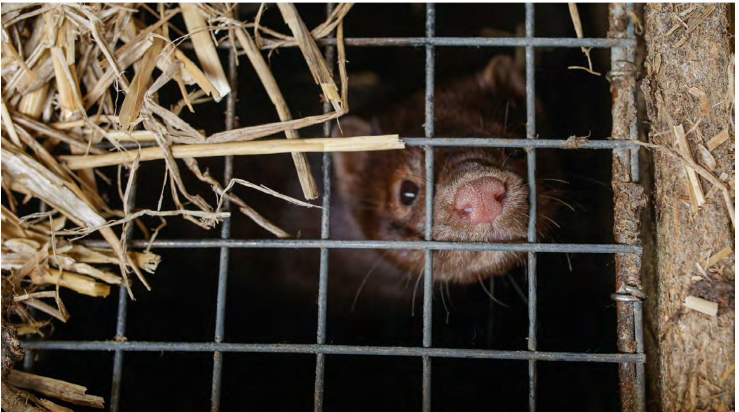
A mink kit recently separated from their mother looks up through a cage on a fur farm. Poland, 2017.

The combined deaths of humans and nonhuman animals that have resulted from fur farming — amounting to a number in the multi-millions, potentially billions over two centuries — should be reason enough to ban this cruel, archaic, and dangerous practice. No material object, including coats, hats, or keychains, is worth the loss of one life, let alone the potential loss of countless more due to this ongoing practice or the next devastating outbreak.