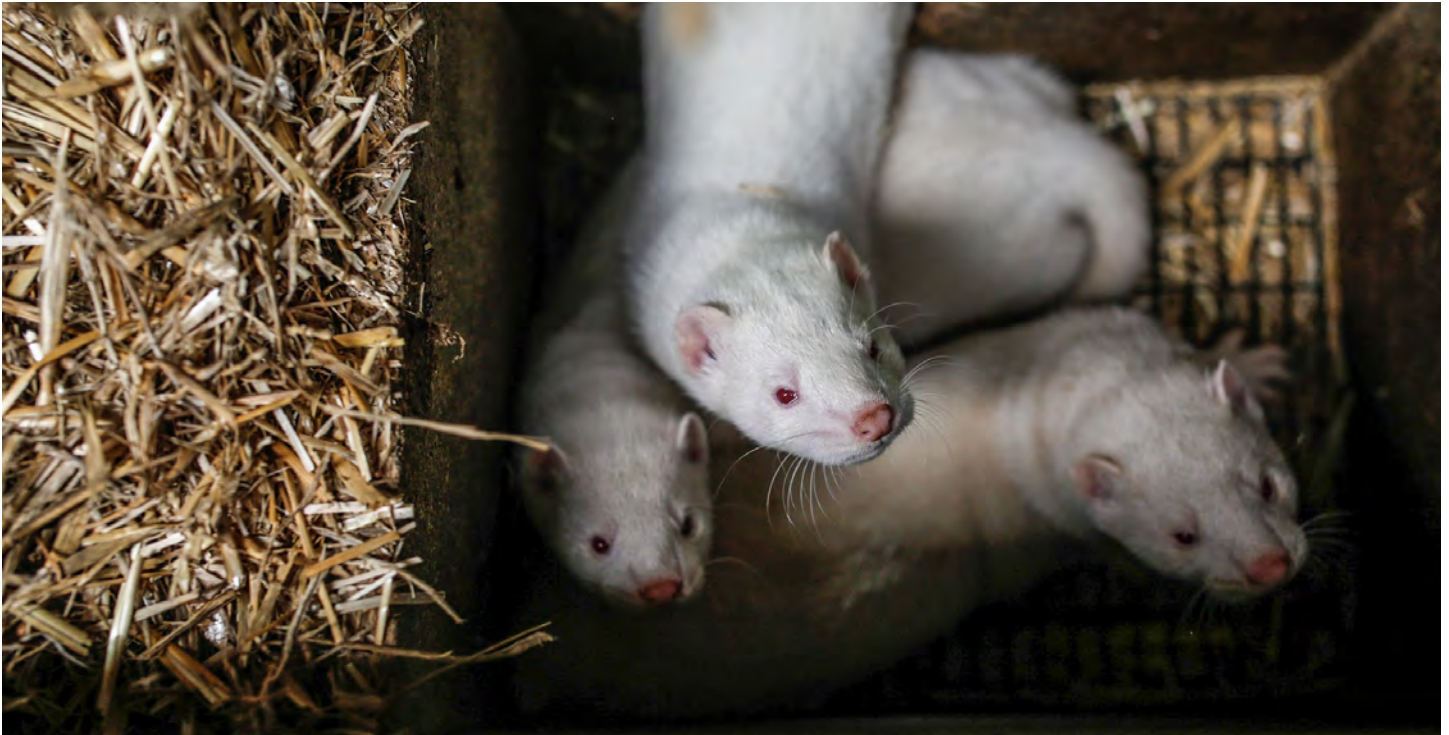
A group of young white mink kits look up from their tiny cage at a fur farm. Minks are solitary animals, and the confined spaces often lead to aggression between animals. Poland, 2017.

Our understanding of the severity of zoonotic disease spread was amplified during the COVID-19 pandemic, which likely originated from human exposure to infected wildlife, and resulted in the death of almost 7 million humans globally, with more than 1 million of those deaths in the U.S. Thought to have originated in a wildlife market in China, COVID-19 also spread rampantly at mink farms across Europe and throughout North America, demonstrating that COVID-19 could be transferred between minks and from minks to humans. These outbreaks resulted in the deaths of millions of minks around the world.