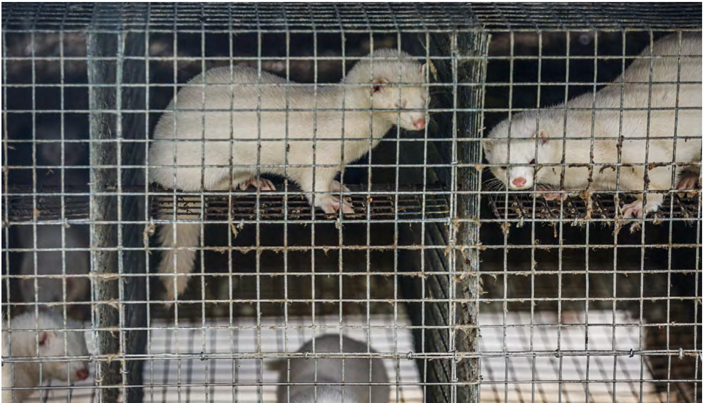
Rows of white minks in barren wire cages at a large mink farm. Poland, 2017.

In general, the federal laws that currently regulate practices relating to animals in the U.S., including the Animal Welfare Act, Humane Slaughter Act, Endangered Species Act, Lacey Act, and the Fur Seal Act do not apply to animals on fur farms. Although the U.S. has adopted two federal laws prohibiting the sale or import of dog and cat products (the Dog and Cat Fur Protection Act) and requires all fur retailers to specify the source and species of all furs sold (the Fur Products Labeling Act), these laws do not take any measures to protect animals on fur farms. Twenty-eight states do not require any type of permit or license to operate a fur farm at all, and only seven states require fur farm inspections (Born Free USA, 2020).