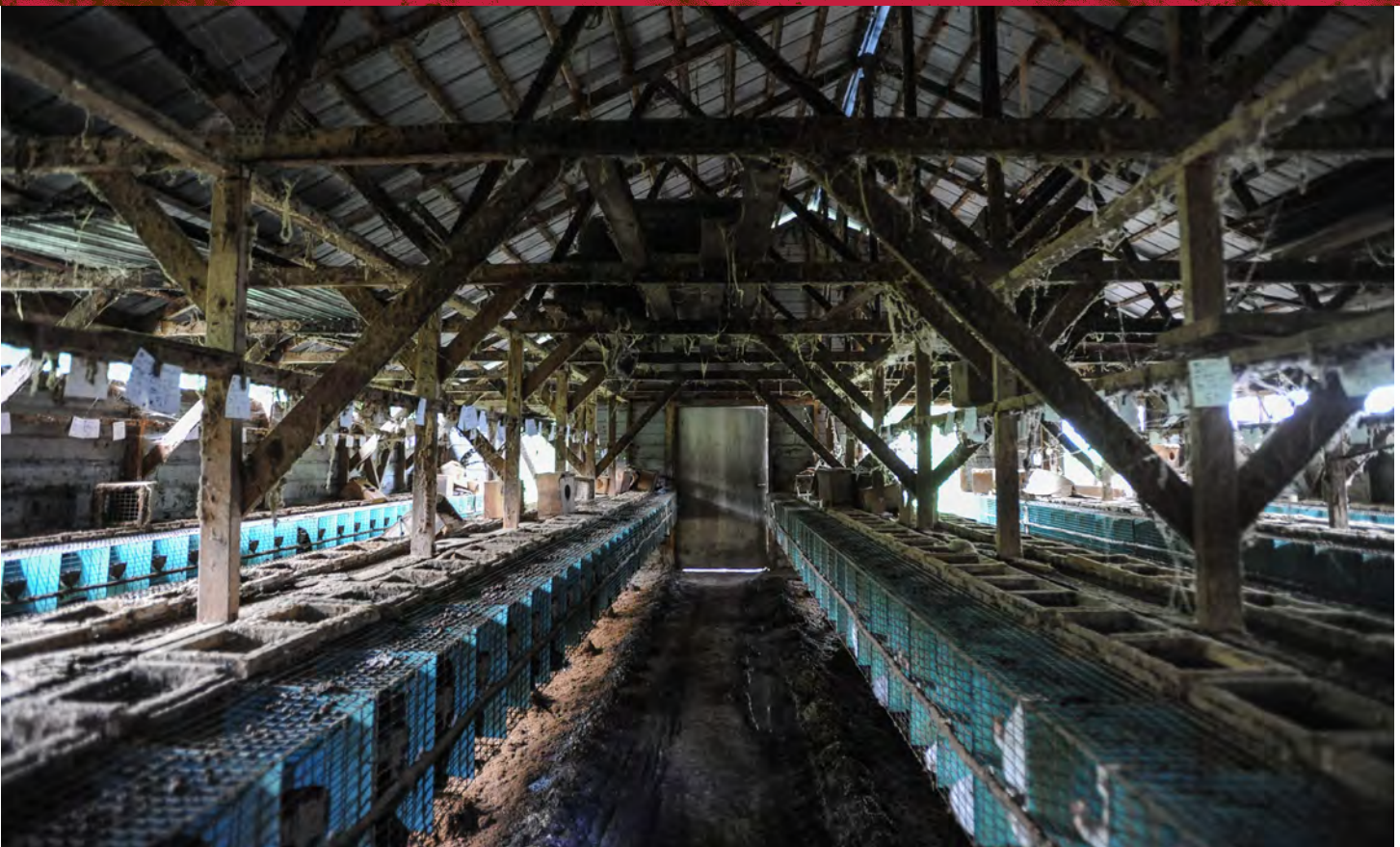
Mink cages at a farm. Quebec, Canada, 2014.

addition to the fur industry, several million animals are trapped in the wild and killed for their fur. Most wild-trapped furbearing animals come from the U.S., Canada, and Russia. In 2018, an additional almost 3 million animals were killed for their pelts via trapping, including 647,000 raccoons and 363,000 coyotes (HSI 1, 2024).