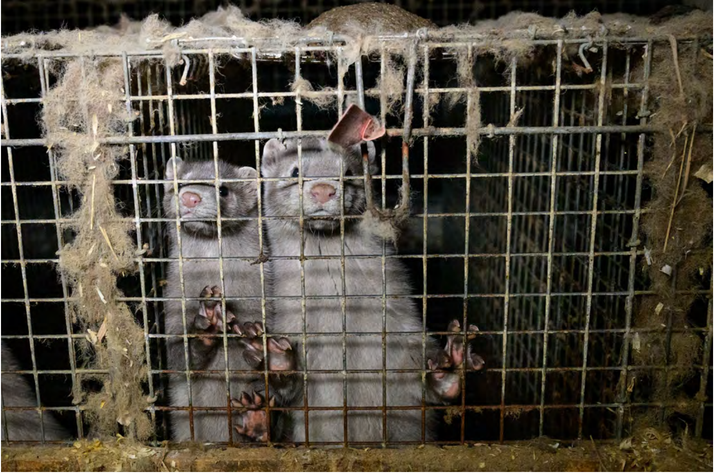
Two grey minks on a fur farm stare through the wire mesh of a filthy cage. Korsnas, Finland, 2023.

Minks were farmed in the U.S. as early as the 1860s (International Fur Trade Federation, 2011). Beginning in the early 1900s, selective breeding of fur-bearing animals on fur farms enabled fur farmers to keep up with quickly evolving fashion trends in ways that trapping had previously restricted. For example, while the foxes caught in the wild for the fur industry were predominantly common red foxes, the controlled environment of a fur farm allowed farmers to select for rare genetic traits that resulted in the appearance of unique “silver” pelts (ranging from black to white). Because these colorations were less common in the wild, they were highly valued in the fur market (Wisconsin 101 1, 2024). As animals with the most desired coat characteristics are often rebred, and animal exchange is limited between farms, these practices often lead to severe levels of inbreeding between genetically related animals, which can have negative health consequences including poor reproductive success (Demontis et al., 2011), high mortality, low growth rate, and higher frequency of hereditary abnormalities (Vogt et al., 2021).