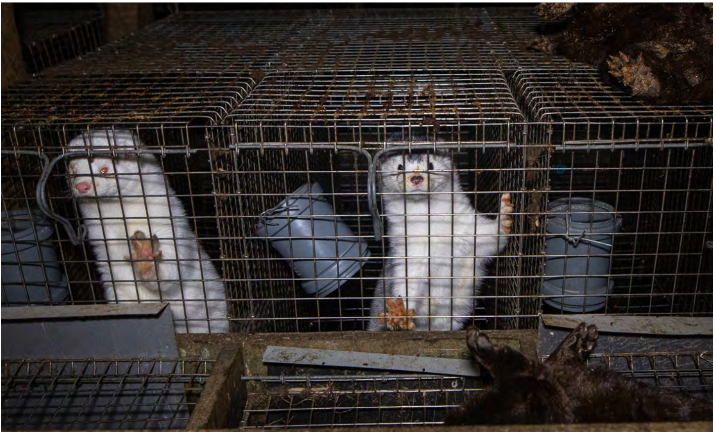
Two white minks stand in their cages at a fur farm. Dead minks lay decomposing atop and in front of the cages nearby. Poland, 2019.

issues for farmed minks include chronic disease, infected wounds, missing limbs due to biting incidents, eye infections, and foot and mouth deformities (Fur Free Alliance 3, 2024). Minks are not covered under the Animal Welfare Act or the Humane Slaughter Act; therefore, almost no requirements mandating veterinary care, killing method, or housing stipulations exist (Born Free USA, 2020).