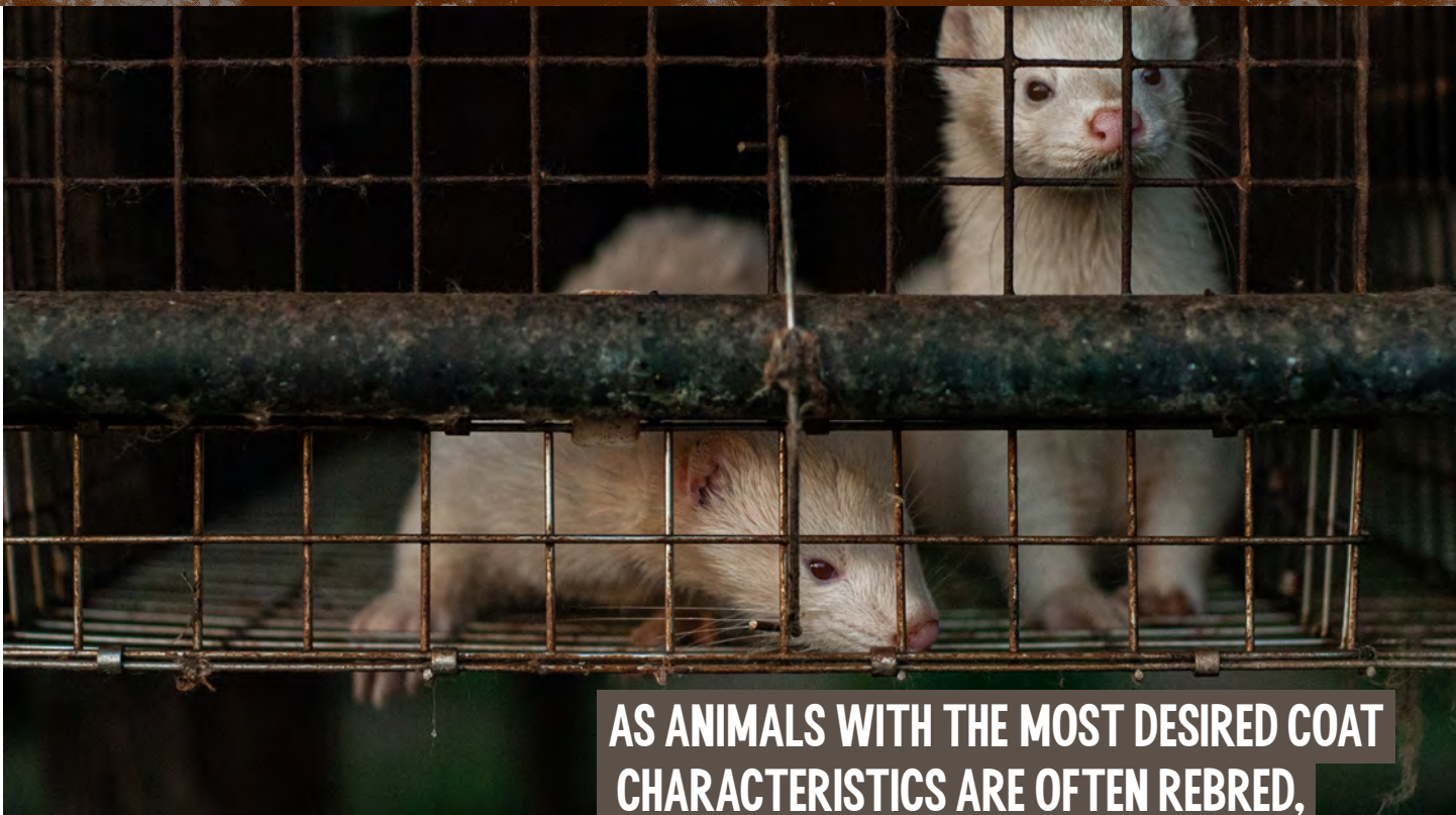
Two minks in a cage in a fur farm in Italy. Minks are kept in steel cages with just a metal grid for the floor. They stay here for seven months before being killed in a gas chamber. Italy, 2012.

AS ANIMALS WITH THE MOST DESIRED COAT CHARACTERISTICS ARE OFTEN REBRED, AND ANIMAL EXCHANGE IS LIMITED BETWEEN FARMS, THESE PRACTICES OFTEN LEAD TO SEVERE LEVELS OF INBREEDING BETWEEN GENETICALLY RELATED ANIMALS, WHICH CAN HAVE NEGATIVE HEALTH CONSEQUENCES INCLUDING POOR REPRODUCTIVE SUCCESS.