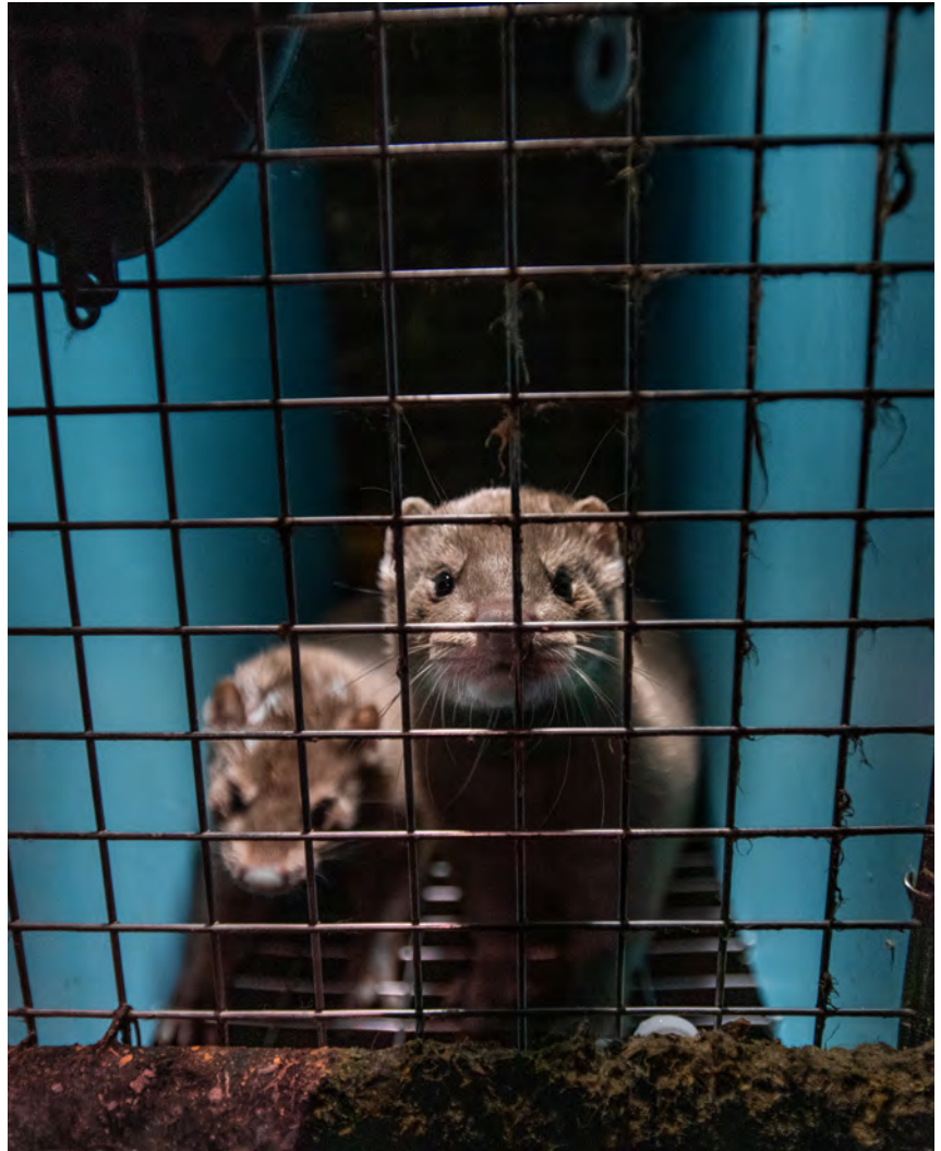
Two minks at a fur farm stare out through the wire mesh of a barren cage. Their tiny enclosure contains no nest or bedding. Quebec, Canada, 2022.

While avian influenza viruses do not replicate very well in humans, if they replicate in an intermediate host species, the virus could then adapt and be spread to humans. Although the biggest avian influenza pandemic-related risk to humans remains through poultry via close contact with infected birds or contaminated surfaces, “sustained circulation of H5N1 within mink could drive the selection of a virus that could transmit by the airborne route. The virus does not adapt the same way in poultry” (Hulme, 2023). First detected at a fur farm in Galicia, northwestern Spain (Foreman, 2023), HPAI has already been confirmed on more than 70 fur farms in Europe and has resulted in the killing of more than 500,000 animals on the grounds of protecting public health. Federal and state authorities have yet to require testing for HPAI on U.S. fur farms, so the extent to which HPAI exists on fur farms in the U.S. remains unknown. To increase the difficulty in detecting this virus, HPAI can be asymptomatic in farmed minks (HSUS 1, 2024).