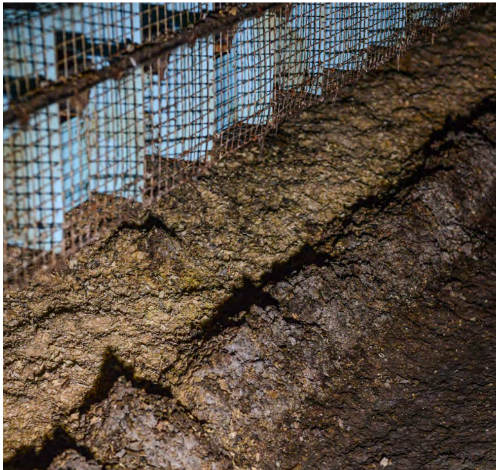
Filthy mink cages at a fur farm. Quebec, Canada, 2014.

Estimating the exact number of animals killed for their fur is difficult to quantify because of the differences between countries in counting and monitoring them. For example, in China, one of the world's largest fur exporters, fur farms are under no obligation to count the animals they kill at all. In other countries, like the U.S., the numbers of animals are measured by the "pelts" they produce. Because some animals produce pelts that are deemed "unusable" by fur industry standards, many animals are unaccounted for, and the suffering and lives lost remains unquantifiable (Foreman, 2023). The number of animals killed for their fur extends beyond fur farms. In