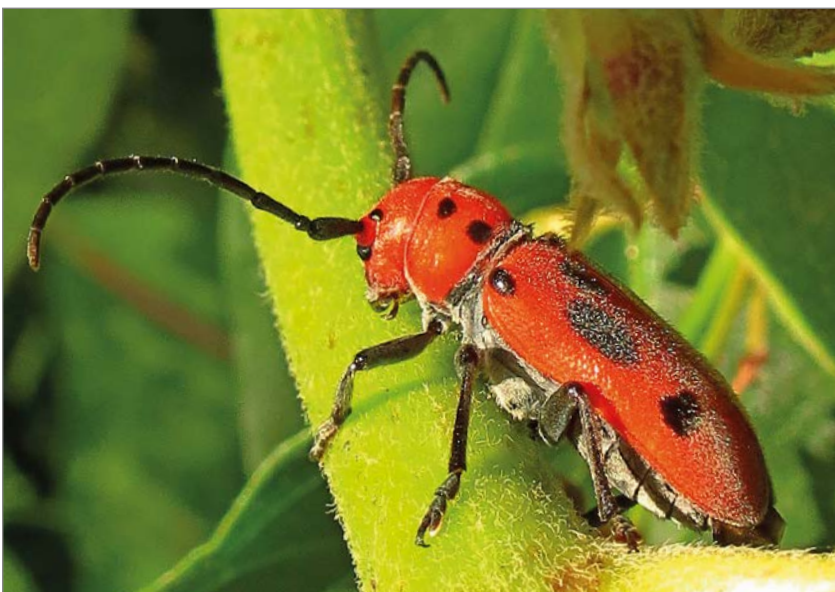
Red milkweed beetle

producers and on those farmers who use these insect-killing super toxins!