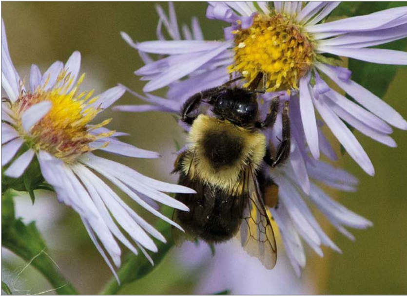
Common eastern bumblebee

neonics killing bees in general, and the likely extermination of bumblebees in particular, could react with anything but rage? Their use and the resulting losses are wrong on so many levels.