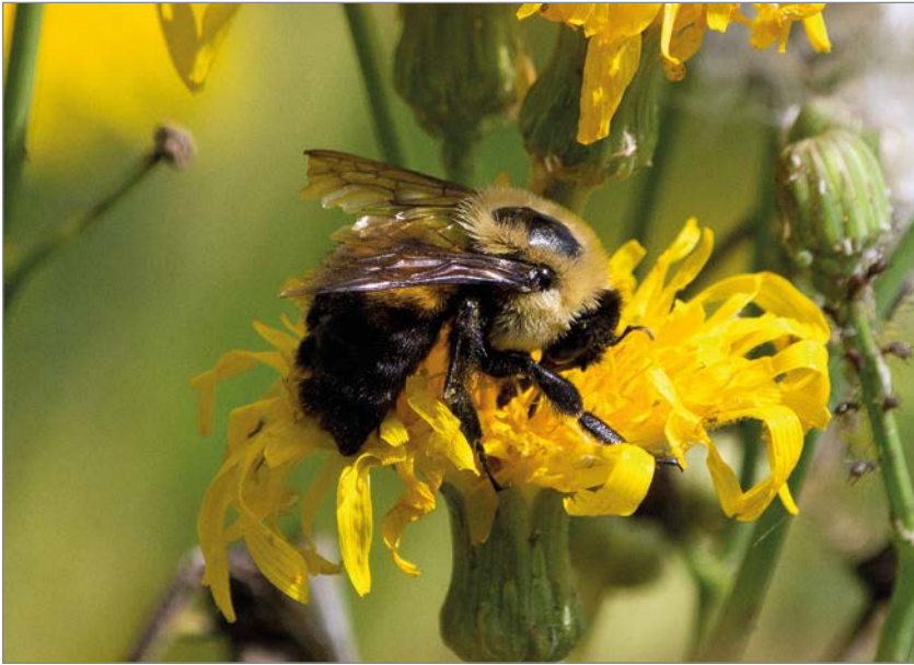
Common eastern bumblebee

recent UN report (Human Rights Council, 2017), Damian Carrington (2017) writes in The Guardian that, “The idea that pesticides are essential to feed a fast-growing global population is a myth, according to UN food and pollution experts”. A major study conducted in the US found that application of neonicotinoids produced no consistent benefits to maize crops (Krupke et al. , 2017). Interviewed by Nature , the lead researcher stated that it is “foolish” to use seeds with pesticides pre-applied (so-called ‘prophylactic’ use), and his summary conclusion is telling: “The way they’re used doesn’t make any sense,” he says. “It only makes sense from one motive. That is the profit motive for the manufacturer” (Christian Krupke of Purdue University, quoted in Cressey [2017]).