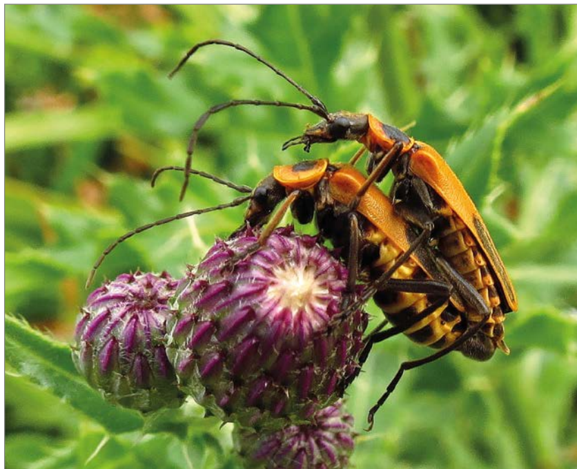
Goldenrod soldier beetles

Perhaps concerted letter writing campaigns are needed. Organize one. Assemble a large and noisy group. Learn how to influence politics on a large scale (an excellent book on this subject is New Conservation Politics [Johns, 2009]). Much needs to be changed at the political level; do you not think it is time to put a huge effort in here? Reverse onus would be a good place to start: instead of society having to prove something unsafe (by an untold number of illnesses and deaths, or environmental catastrophe) the proponent must prove it safe before approval (by a proper process, unlike today's processes). How about the removal of limited liability from corporate