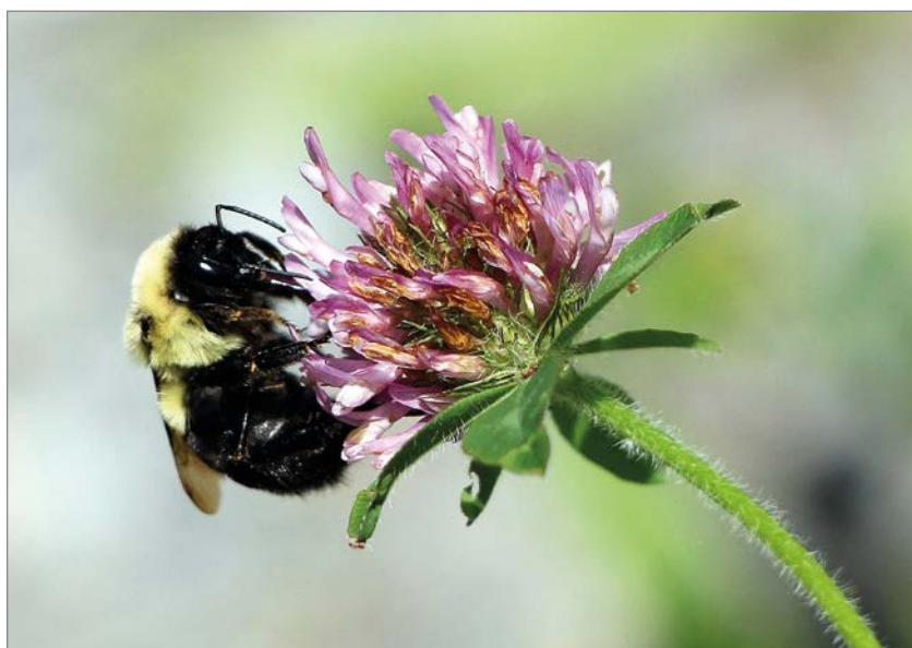
Common eastern bumblebee

The situation is made even worse, if that is possible, by the knowledge that pesticides are not needed. Summarizing a