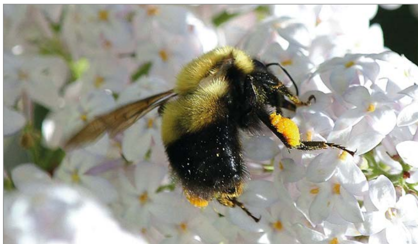
Common eastern bumblebee

Of course while all this directs attention to agriculture's failed microcosm, we are aware this is just part of the greater failure of our society's paradigm to be life-affirming rather than death-dealing. While the paradigm problem is outside the purview of this editorial, it casts its long shadow over the discussion. Ah, another editorial! ■