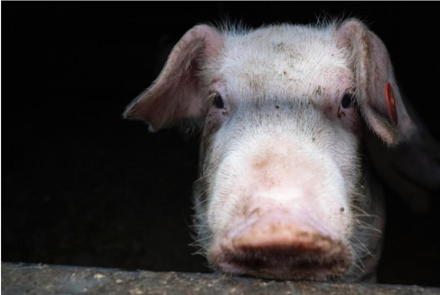
A piglet at a "high-welfare" farm.