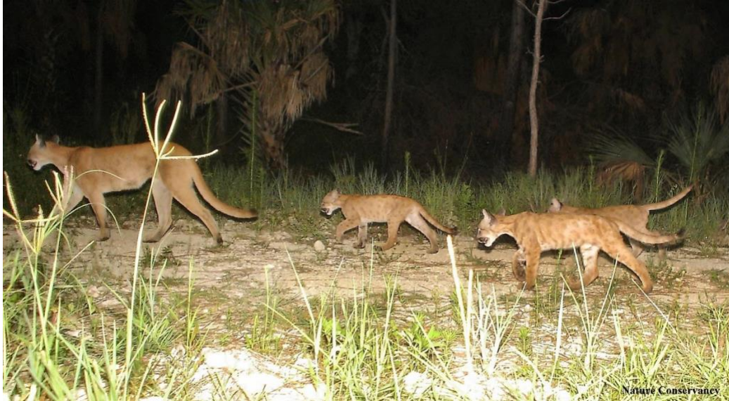
A group of wild Cats...

https://conservancy.org/bad-idea-resurrected-take-action-on-detrimental-development-plan/ : Don't let this species go extinct that would be a tragedy for all of us