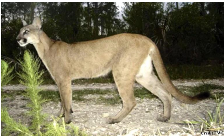
The elusive Florida Panther

One of the agencies involved in panther protection is the state agency Florida Fish Wildlife Commission (FWC). Every year they receive a budget of about half a billion, you read that right, to conserve and protect the state's imperiled wildlife and water. But they have sordid history of doing the opposite. The commission has always been stacked with hunters and developers never conservationists.