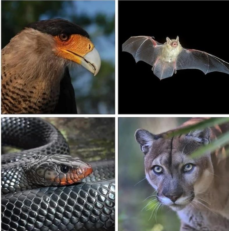
Going going gone. These species may end up being just a memory as they continue to lose their land and life. Clockwise from upper left: crested caracara (Isabel Gottlieb); tricolored bat (Scott Altenbach); Florida panther (fotoguy22); eastern indigo snake (Dirk Stevenson):

Every day it seems there is a new assault on the open space these magnificent animals have called home as long as they have roamed the earth. As developers continue to carve up their dwindling habitat with the apparent blessing of the state, we all lose OUR open space to private holdings. In 2015 one of the Florida Wildlife Conservation (FWC) commissioners came under fire for trying to get panthers on the hunting list.