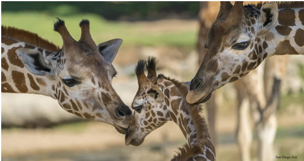
Masai Giraffe mother nuzzling her calf

There are an estimated 68,000 giraffes left but accurate population numbers of wild animals can be difficult to obtain. Over the years it's thought their population has dropped by over 40 %, mostly due to hunting and habitat loss and degradation. While those numbers may not seem like an urgent call to save them many sub species are on the brink of extinction and could vanish in a few years.